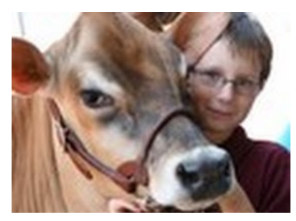
From a Dutchess Co. Fair brochure

(ed. note: Nice web site, but I could not find anything about the exhibit there or on the Historical Society web site. Probably one should check back later.)